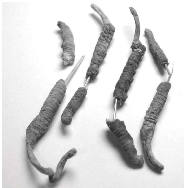
FIGURE 4. Wire and twigs inserted into Cordyceps to increase weight.

Although the presence of lead or other substances in the growth medium certainly could be absorbed by any growing organism, these authors have conducted chemical analyses on many thousands of Cordyceps samples over the years, and it has been our observation that Cordyceps does not have any more of a tendency to accumulate lead or other heavy metals than any other fungi. Cordyceps cultivated by any of the usual modern practices is very safe from any heavy metal contamination.