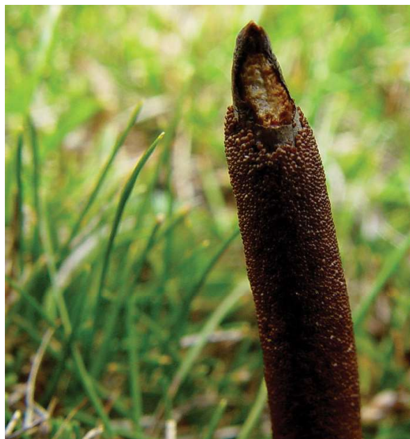
FIGURE 2. Close up of wild Cordyceps showing spore-bearing surface and slight insect-feeding damage at the tip.

In historical and general usage, the term “ Cordyceps ” normally specifically refers to the species C. sinensis . However, the name “ Cordyceps ” has come to be used for a number of closely related species over the last few years, which have been