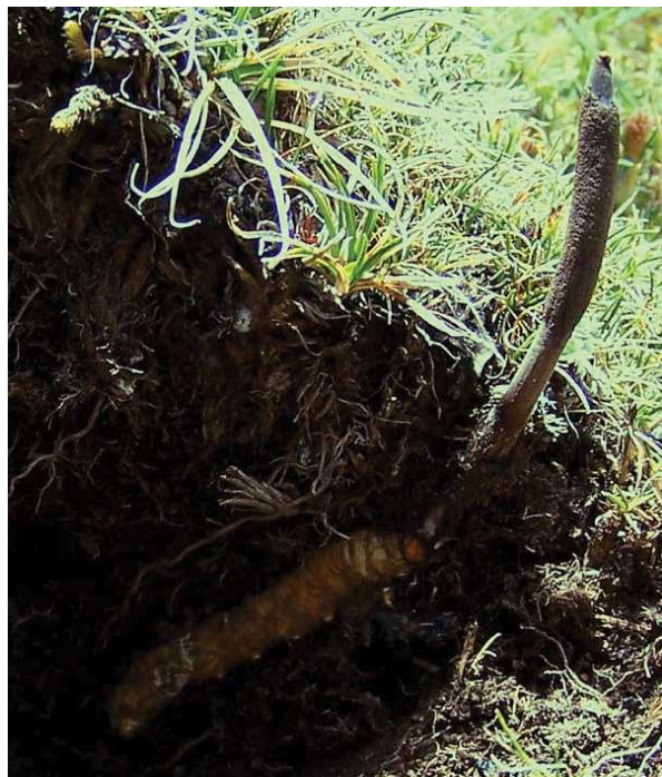
FIGURE 1. Cordyceps sinensis in its natural habitat (4550 meters in Tibet, China).

Most people in the West have only come to know about Cordyceps within the last 20 years, during which time, modern scientific methods have been increasingly applied to the investigation of its seemingly copious range of medicinal applications in an attempt to validate what Chinese practitioners have noted for centuries. 3