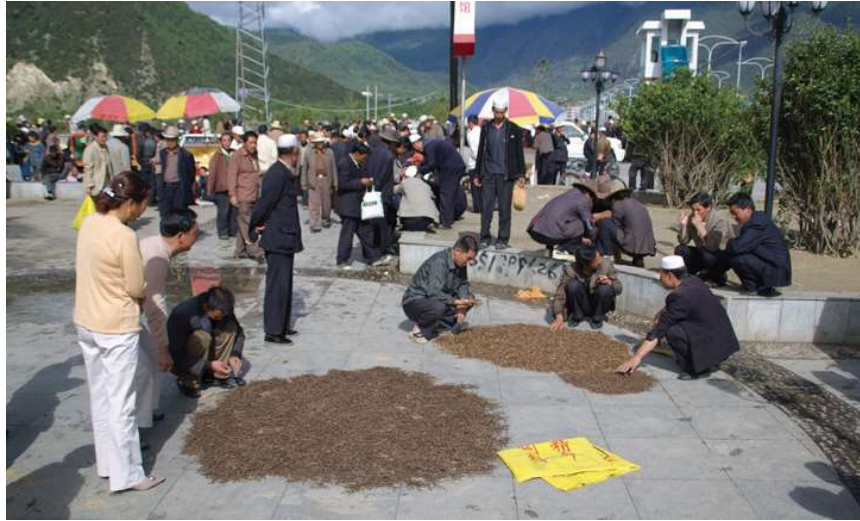
FIGURE 3. Cordyceps market in Ningchi (aka Bayi), Tibet. Cordyceps spread out on the road for buyers to view.

found to be much easier to cultivate. Although C. sinensis may be the most well-known species, there are many other species in the genus Cordyceps in which modern science may have uncovered potentially valuable medicinal properties.